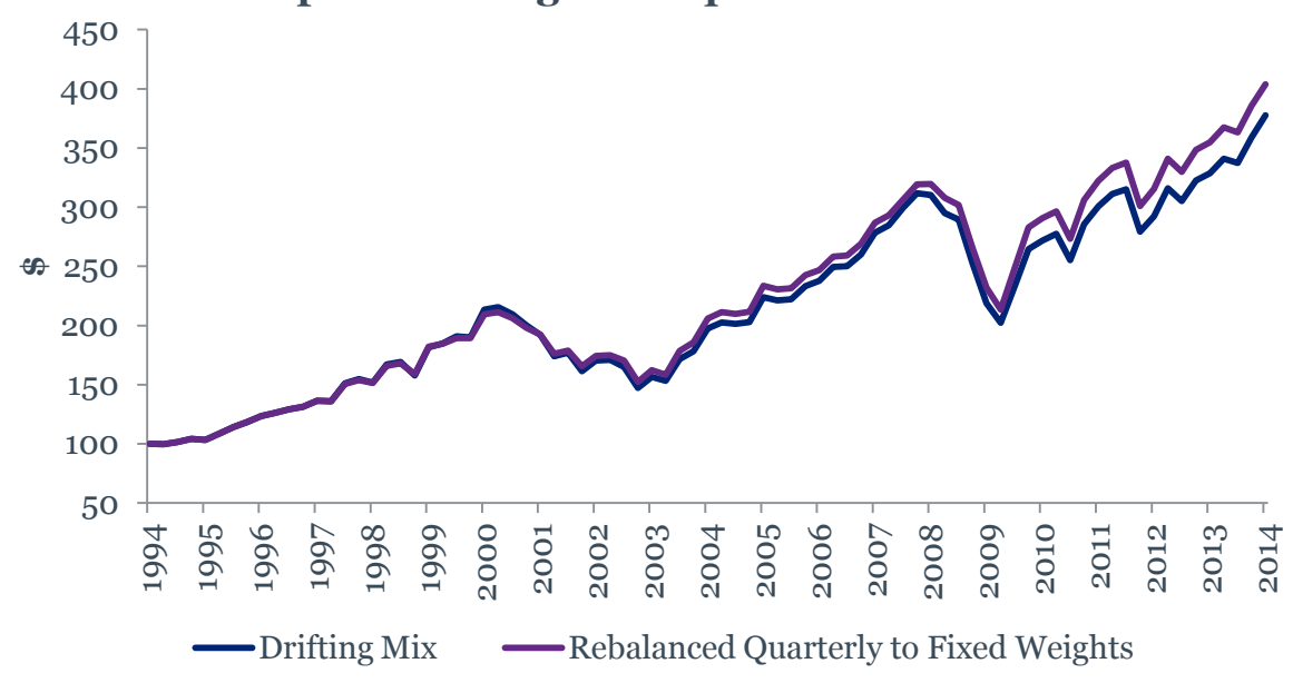
Growth of a drifting vs. quarterly rebalanced 65:35 portfolio of global equities and bonds

Systematically buying more of the asset which has fallen in value, and selling some which has risen in value to keep composition steady over time.